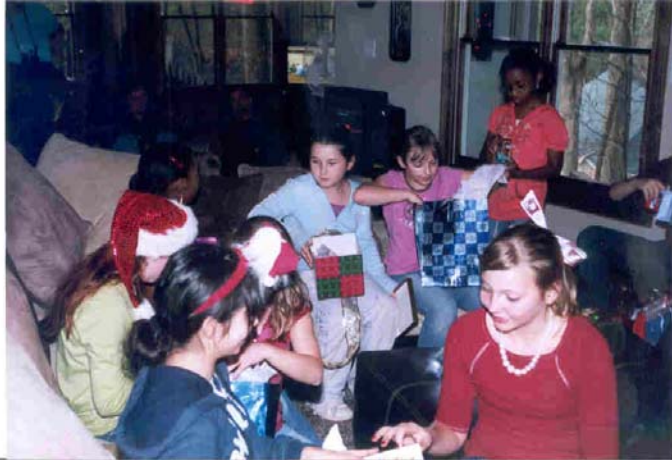
The skaters open gifts and enjoy what they received.