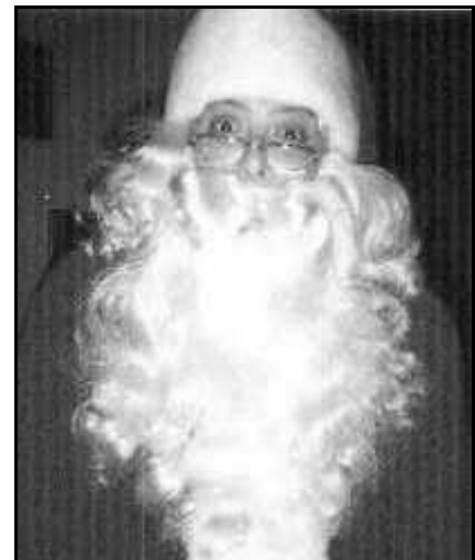
Santa showed up to spread Holiday cheer