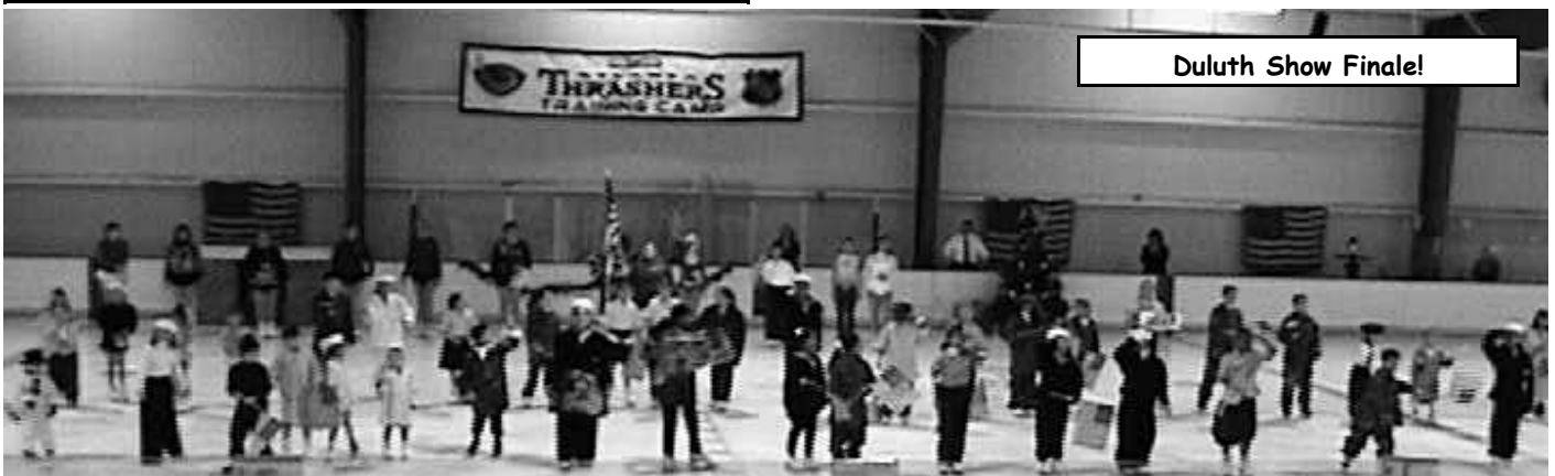
Duluth Show Finale!