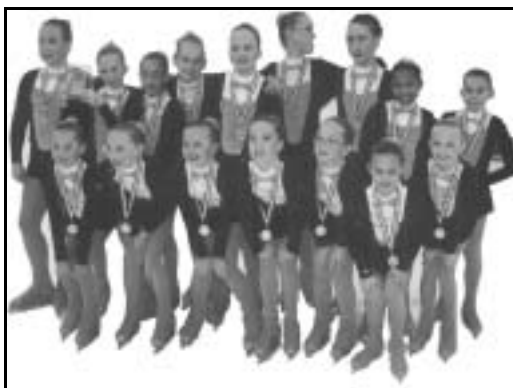
The preliminary team proudly displays their gold medals at Eastern Sectionals.