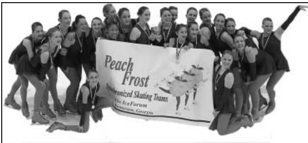
The proud Peach Frost intermediate synchronized team at the awards ceremony in Lowell, Massachusetts after winning gold at Eastern Sectionals.