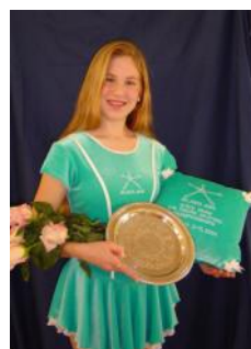
Presenter at 2004 US Nationals

You can donate by going to the following page on our website: